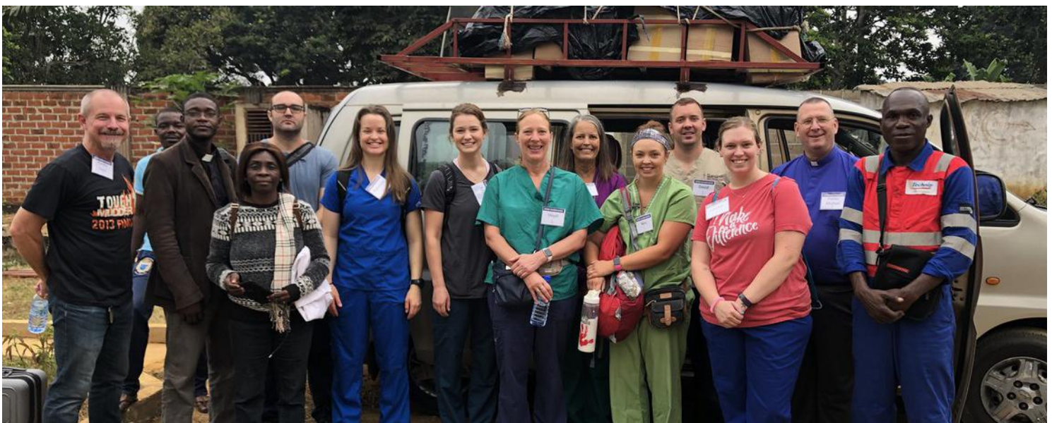
Group picture of the Congo-Brazzaville Mercy Medical Team July 2019 – with minibus drivers and volunteers of the Lutheran Church of the Republic of the Congo.