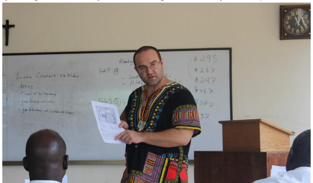
Using the artwork of Lucas Cranach to teach on Law and Gospel at the ELCG seminary.