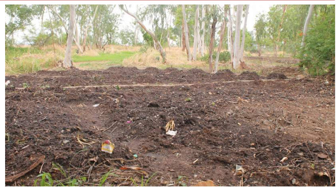
The rains have returned to Dapaong after a long dry season. This means it is time to plant. Pictured here is the vegetable garden at my house. You can see the sweet potato mounds toward the back of the garden.