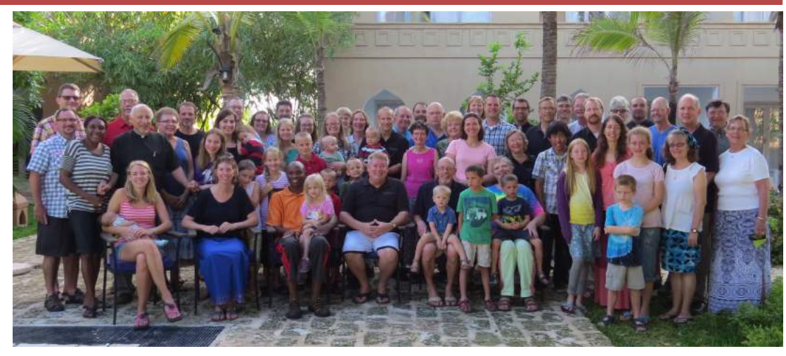
All-Africa LCMS-OIM retreat group picture with visitors from the LCMS International Center and St. Andrew Lutheran Church

For continued, generous support of this and other ministries of our Synod with gifts and prayer.