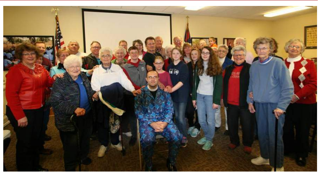
Numerous supporters from parts of lowa and Nebraska share a prayer and blessing over me during a presentation on March 19th at Mission Central in Mapleton, lowa