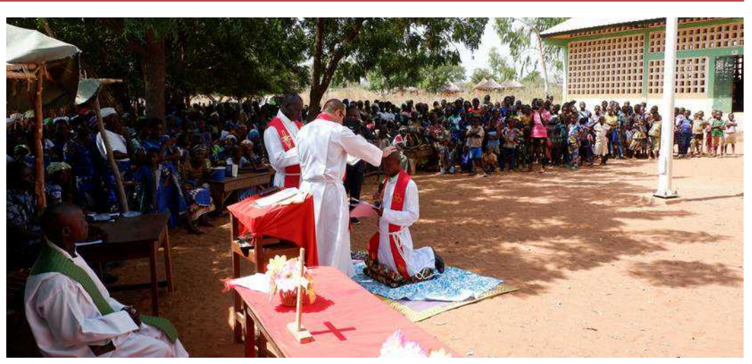
Pronouncing a blessing over the candidate during the rite of Holy Ordination.