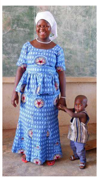
In Africa people like to have shirts or fabric printed to commemorate a special celebrations or to identify with a particular group. It encourages community identity and solidarity. Here are two examples of such fabric. To the left is one of the visitors from Ghana that attended the ordination. She is wearing the fabric that the Lutheran Church of Ghana printed for their recent 60th anniversary celebrations. To the right is a Togolese woman and her children wearing the fabric for the Lutheran Church of Togo.