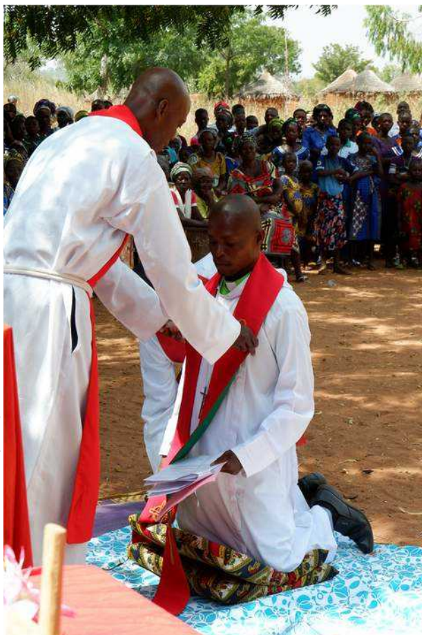
Receiving a stole in the rite of Holy Ordination – a symbol of the yoke of Christ's Ministry