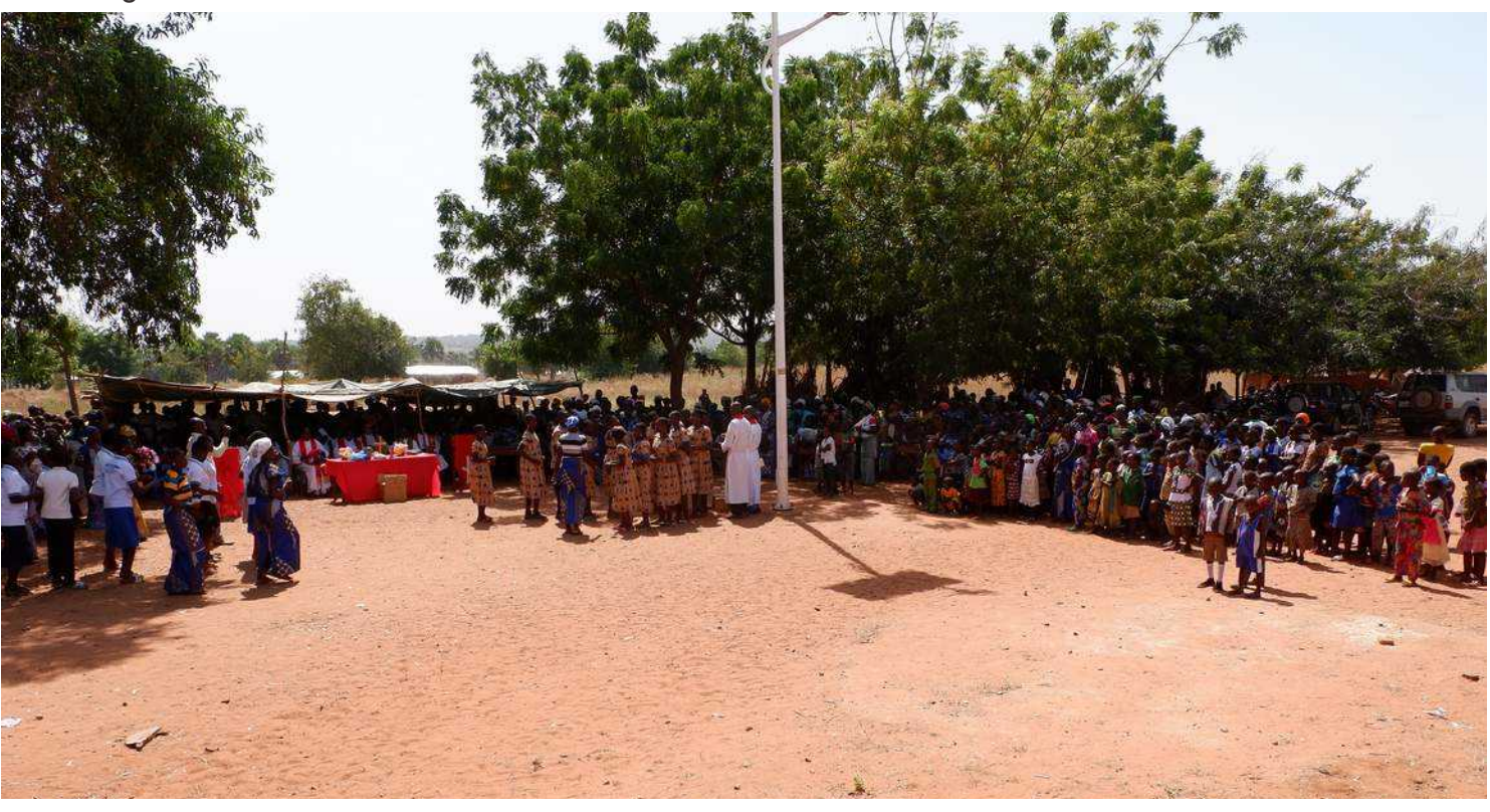
The various choirs begin their dances during the offering. The pastors and other local leaders are seated under the tarp while members of the parish and the community crowd into the shade of the nim trees.